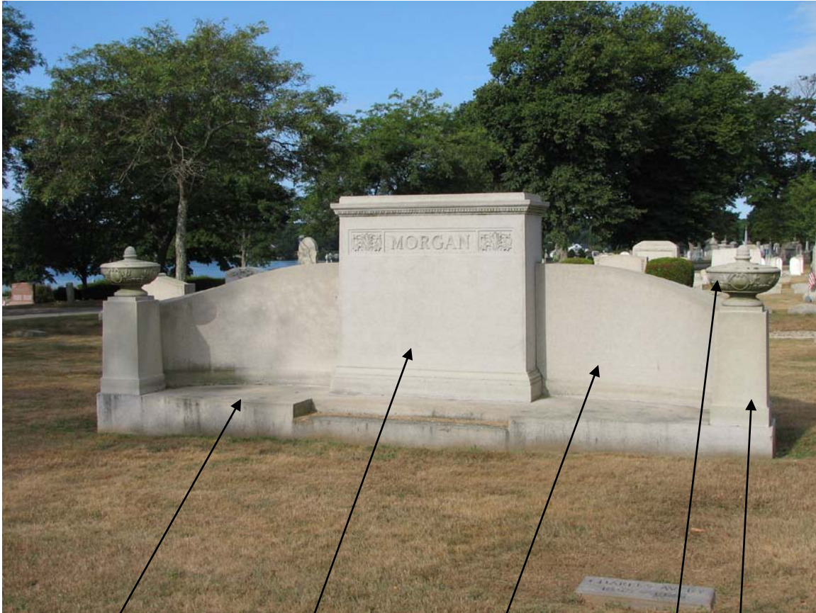
Figure 19-2. Morgan Monument, River Bend Cemetery, Westerly, RI

The Morgan Monument is made of eight pieces of granite.